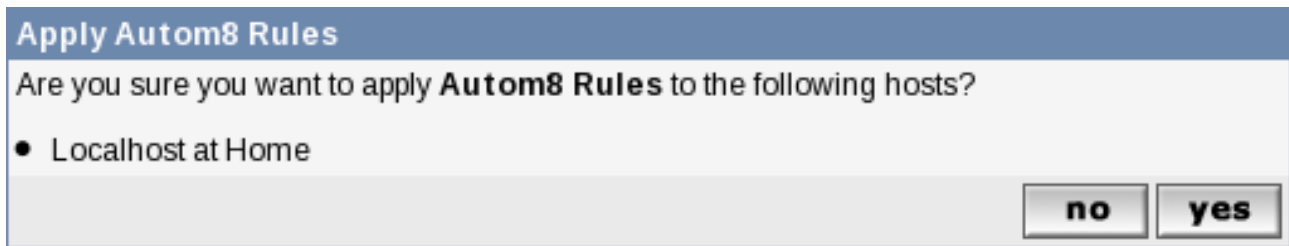
Illustration 23: Confirmation for applying Graph Rules

You will be prompted by a confirmation page like: